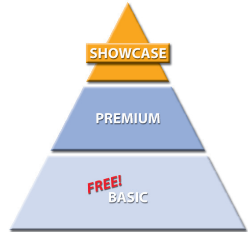
Listing Levels on LoopNet